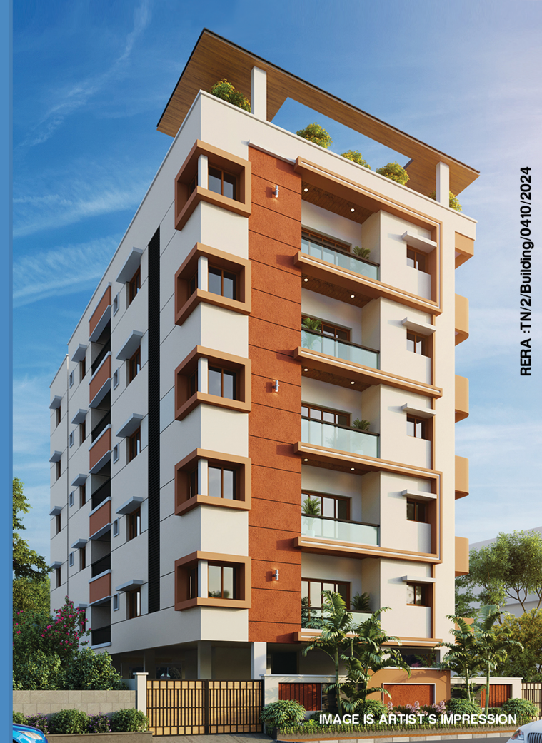
IMAGE IS ARTIST'S IMPRESSION